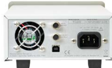
Click to Enlarge Back Panel of the TC200 Heater Controller