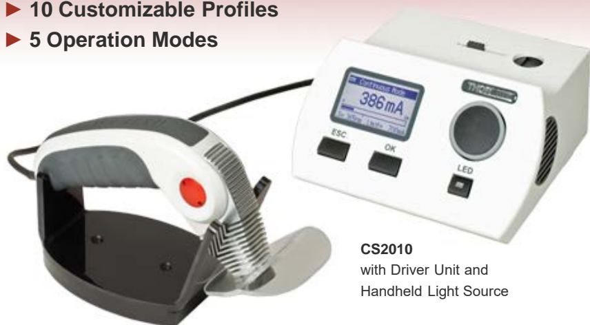
CS2010 with Driver Unit and Handheld Light Source