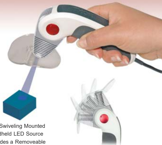
The Swiveling Mounted Handheld LED Source Includes a Removeable UV Beam Shield