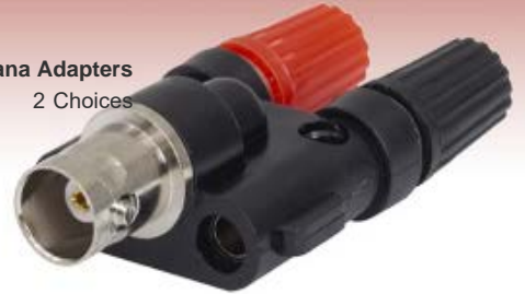
Banana Adapters 2 Choices