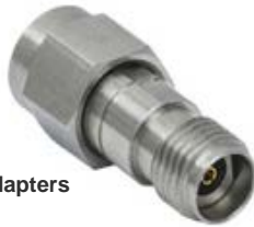
2.92 mm Adapters 7 Choices