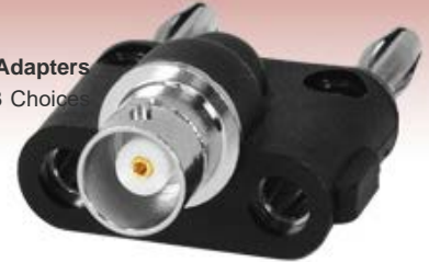
Banana Adapters 3 Choices