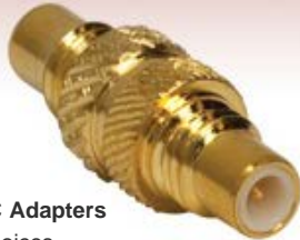
SMC Adapters 2 Choices