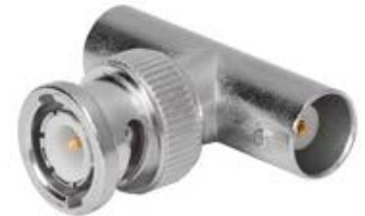
BNC Adapters 7 Choices