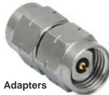
2.4 mm Adapters 7 Choices