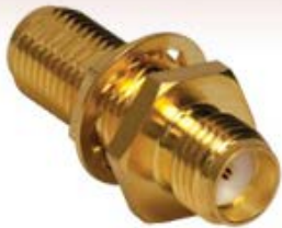
SMA Adapters 5 Choices