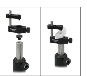
Click for Details PCM Clamp Used with PCMP Prism Base to Mount a Dove Prism Over the 1/4"-20 Tap of a Ø1/2" Post

Click to Enlarge PCM Post Clamp Mounting a GRIN Fiber Collimator Using the PCMV V-Groove Base Adapter