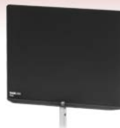
TPS4 Centered Through Hole for 8-32 (M4) Post Mounting