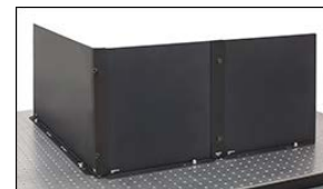
Click to Enlarge TPS5 and TPS6 Joined to Form a Continuous Enclosure

These Joiner Plates allow our straight laser safety screens to be joined together to form a continuous barrier or complete enclosure around an experiment; please refer to the table to the right for compatible screens. Flat and 90° corner plates are available.