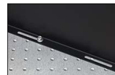
Click to Enlarge Aluminum Screen Mounted to an Optical Table

These screens are not intended to serve as permanent beam dumps. For such applications, Thorlabs offers a comprehensive family of beam traps and beam blocks.