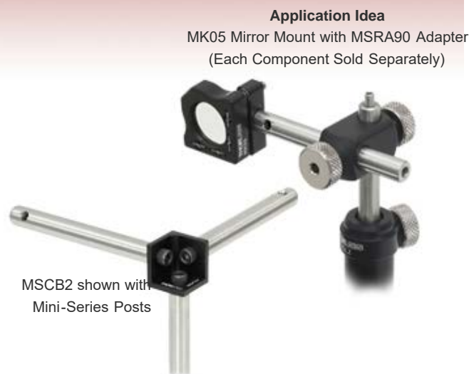
Application Idea MK05 Mirror Mount with MSRA90 Adapter (Each Component Sold Separately)