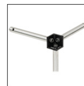
Click to Enlarge Three Ø6 mm Posts Attached to an MSCB1

We also offer the MSCB3(M) 1/2" (12.7 mm) Construction Cube with 8-32 (M4 x 0.7) mounting holes for use with larger optomech like Ø1/2" Posts.