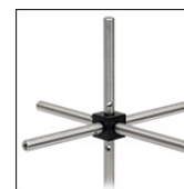
Click to Enlarge Six Ø6 mm Posts Attached to an MSCB1