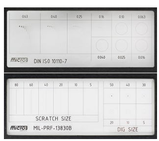
Click To Enlarge Detail of MOTP-ISO (Top) and MOTP-MIL (Bottom) Surface Imperfection Standards

The MOTP-ISO panel is defined by the ISO 10110-7 standard. The imperfections are evaluated and classified depending on their physical sizes with no distinction between a scratch and a dig. All imperfections can be considered scratches of different sizes.