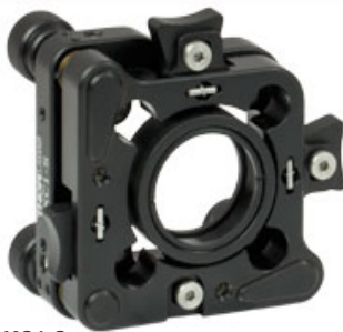
KC1-S SM1 (1.035"-40) Tap in Front Slip Plate