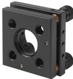
SM1 (1.035"-40) Tap in Front Plate