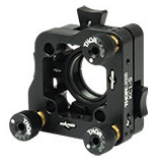
Click to Enlarge KC1-S Back View

The KC1-S Kinematic Mount is designed with a SM1 (1.035"-40) threaded mounting hole with a front slip plate that enables direct mounting of optics up to 5.8 mm (0.23") thick using the included SM1RR Retaining Rings. Thicker optics can be accommodated by housing the optic in one of our SM1-Series Lens Tubes and then threading the lens tube into the front plate of the mount. Alternatively, since the back plate of the KC1-S Kinematic Mount features an oversized \varnothing 1.32 " bore, SM1 lens tubes can also be attached to the front plate from the rear of the mount without sacrificing angular adjustment. This threaded, kinematic mount comes with three adjusters with independently locking setscrews.