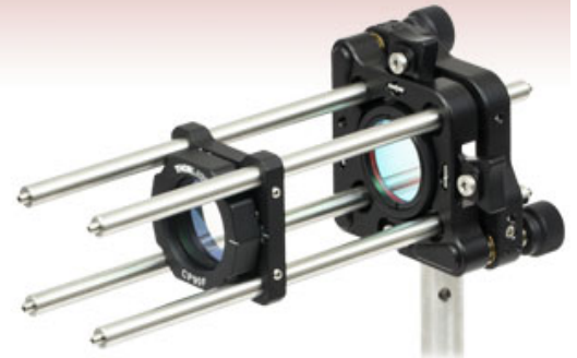
KC1-S Retroreflector Cage (Components Sold Separately)