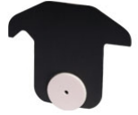
Back View of VRC4CPT

The CPA1 and CPA2 Alignment Plates are convenient tools for aligning cage-based optical systems. These drop-in plates feature a small through hole at the exact center of the 30 mm cage assembly that is used for aligning visible beams. For easy alignment, the through hole is surrounded by engraved rings, which indicate \varnothing 4 mm, \varnothing 7 mm, \varnothing 10 mm, and \varnothing 13 mm. The CPA1 provides a \varnothing 0.9 mm through hole, while the CPA2 provides a \varnothing 5 mm through hole.