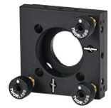
Click to Enlarge KC1 Back View

The KC1 Kinematic Mount is designed with a smooth, double-bored mounting hole that can accommodate a Ø1" optic that is at least 0.12" (3 mm) thick; the optic is held in place with a top-located, nylon-tipped locking screw. This kinematic mount comes with three 1/4"-80 adjusters that offer an adjustment per revolution of 7 mrad/rev. In addition, each adjuster has independently locking setscrews.