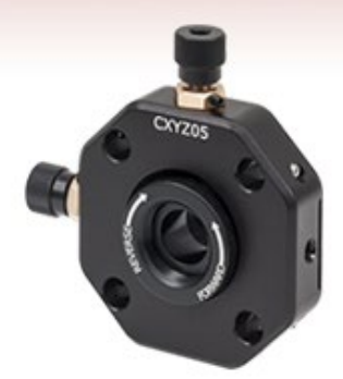
CXYZ05 Knurled Dial Translates the Z-Axis Mounting Carriage