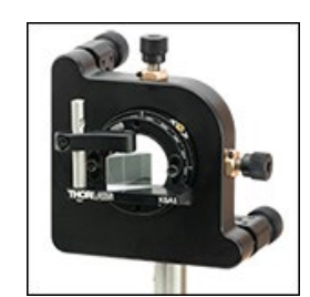
Click to Enlarge [APPLIST] [APPLIST] K6A1 Prism Accessory Mounted onto a K6XS 6-Axis Mount

The K6A1(/M) platform accessory is designed to be mounted on the rotation ring on the K6XS 6-axis kinematic mount and our 30 mm cage-compatible rotation mounts using the included 4-40 screws and hex key. The platform has a height adjustment range of 1/4" (6.3 mm) so that the mounted optic can be positioned on the axis of rotation. Four 6-32 (M4 x 0.7) tapped holes at the corners of the platform surface can be used to mount the included PM3 (PM3/M) prism clamping arm or other optomechanics.