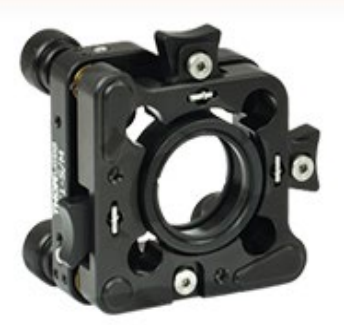
KC1-S SM1 (1.035"-40) Tap in Front Slip Plate