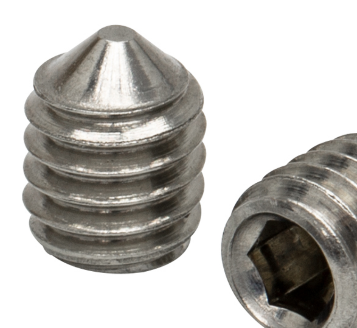
Pack of 10