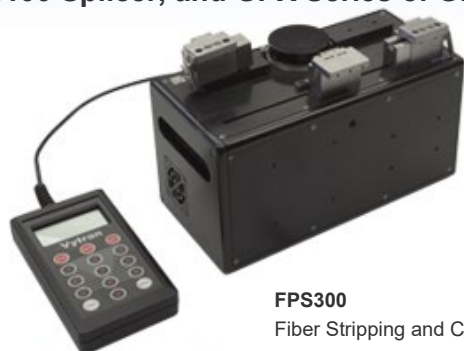
FPS300 Fiber Stripping and Cleaning Station