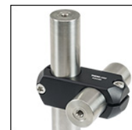
Click to Enlarge Two Ø1" Posts Mounted Orthogonally Using the RSA90 Clamp

Thorlabs' RSA90(M) Right-Angle Clamp allows one Ø1" (25.0 mm) post to be mounted perpendicularly to another Ø1" (25.0 mm) post. The clamp features a highly stable flexure lock design that is secured using a 3/16" (5 mm) balldriver. The center-to-center distance between the two posts is 1.25" for the imperial version and 30.0 mm for the metric version.