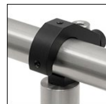
Click to Enlarge Two Ø1" Posts Mounted Orthogonally Using the RM1D Clamp