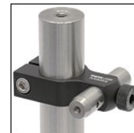
Click to Enlarge A Ø1/2" Post Mounted Perpendicularly to a Ø1" Post Using the RA90RS Clamp

The C15QR(M) handle can replace the 1/4"-20 (M6) clamping screw for better control when adjusting the clamps. Note that the C10QR(M) handle is not compatible with these clamps.