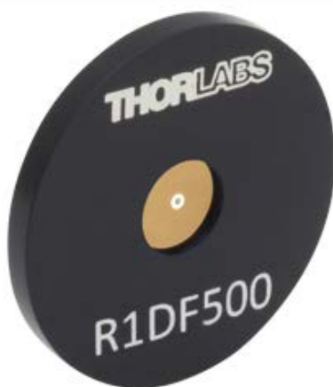
R1DF500 Annular Aperture Target Obstruction Diameter = 500 \mu\text{m} Pinhole Diameter = 1000 \mu\text{m}

Application Ideas R1CA2000 Obstruction Target Mounted in CXY1Q Translation Mount with Quick-Release Plate