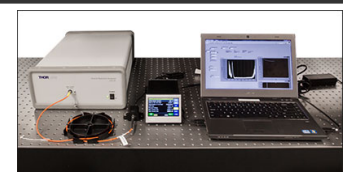
Click to Enlarge The setup for testing the relationship between LED wavelength and current. See the table below for a complete item list.

LEDs have relatively broad, asymmetric emission profiles. The centroid wavelength of an LED is a weighted average of the wavelength across the emission profile (following a similar concept to center of mass calculations). It is defined as