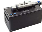
Click to Enlarge The PTR204B Manual Fiber Recoater has a maximum recoat length of 100 mm.

These manual recoaters have two options for the recoat material injection system: manual pump or automatic pump. For the manual injection system (Item #s PTR203B and PTR204B), the user is required to dispense the recoat material into the mold cavity. The manual injection system is compatible with both low- and high-index recoat material (sold below). An automatic injection system (Item #s PTR203 and PTR204), which is only compatible with high-index recoat material (sold below), uses a pump to inject the recoat material. An add-on unit that can use both low- and high-index recoat materials is available; please contact Tech Support for more information. The amount of material dispensed by the automatic injector is controlled by hand via the top-mounted "Inject" button or programmed into the machine by the handset controller.