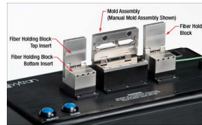
Click to Enlarge Thorlabs' Fiber Recoater detailing the mold assembly, fiber block holders, and fiber block inserts.

Thorlabs' Vytran™ Fiber Recoaters restore the coating to a fusion-spliced fiber. The recoating process uses a volumetric dispensing pump to inject the recoat material into the mold cavity. This pump is available with an automatic injection system (Item #s PTR205, PTR203, and PTR204) or a manual injection system (Item #s PTR203B and PTR204B). The recoated fiber is then cured with an ultraviolet (UV) source. The manual injection system is required for applications using low-index recoat material. The fiber recoating process restores the buffer coating to a stripped fiber, giving it the same flexibility as when originally manufactured. Unlike standard heat shrink protection sleeves, a recoated fiber can be handled and coiled normally, without risking the fusion-spliced section of fiber.