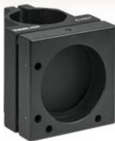
C1507 Ø2" Mirror Mount