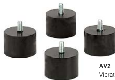
AV2 Vibration Absorbing Feet