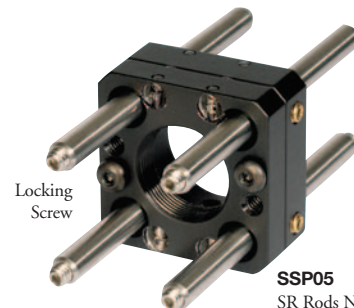
SSP05 SR Rods Not Included

The Slip Plate Positioner is designed to provide coarse XY positioning of optical components within our cage assembly system. This design provides manual adjustment only and is best utilized in conjunction with an alignment laser to monitor centricity.