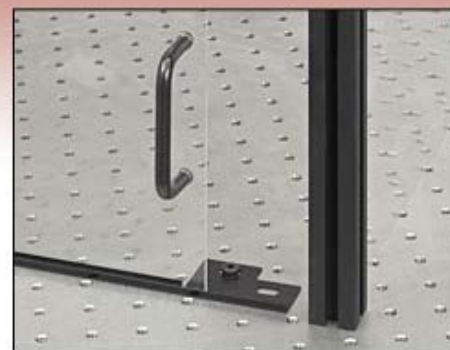
Track for Sliding Doors Attaches to Breadboard